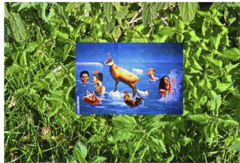
6 of 7 'Arrangements #004,' 2016