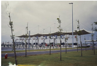
2 of 7 ‘France #012,’ 2016