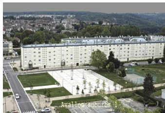
3 of 7 ‘France #033,’ 2016