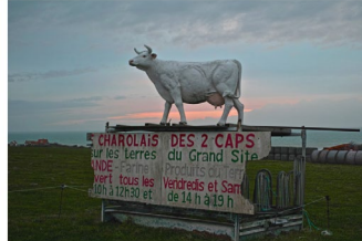
5 of 7 'France #004,' 2016'