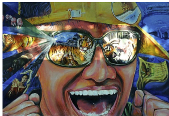
7 of 7 'Tourisme #002,' 2016 COURTESY THE ARTIST AND VENUS, NEW YORK