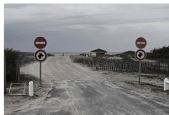
4 of 7 ‘France #017,’ 2016