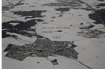
1 of 7 ‘Mission #001,’ 2016