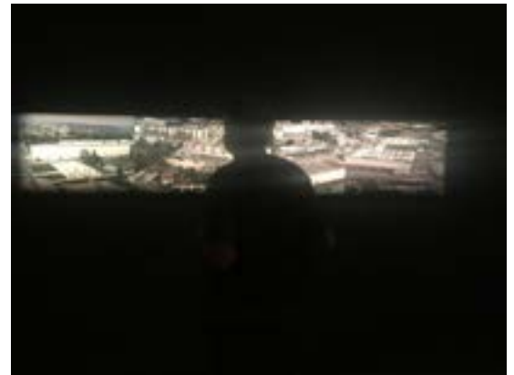
A MAN STARES AT A QUADRPTYCH BY MICHEL HOUELLEBECQ AT THE OPENING OF "MICHEL HOUELLEBECQ: FRENCH BASHING," THE AUTHOR'S FIRST ART SHOW IN THE US ON FRIDAY IN NEW YORK

MH: Well, it's tourism. ("Ben, c'est le tourisme.") LSP